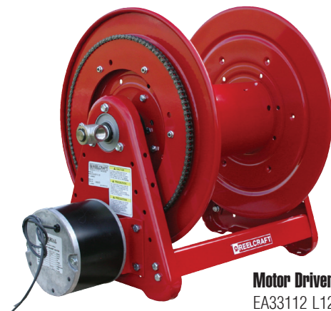
Motor Driven EA33112 L12D