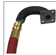
Removable gooseneck makes hose installation easy.