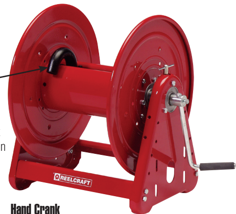
Hand Crank CA32112 L